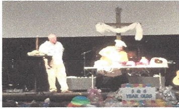
At Anastasia Baptist Church, Presenting the Gospel to children at the Easter Egg Hunt.