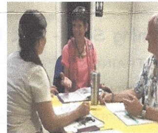
In the Classroom !

Right: Classroom instruction is thought provoking. Learning gospel principles that are based on scripture makes it fun and beneficial for a lifetime.