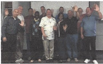
"Share Your Faith" classes in Lakeland at FBC Crestview