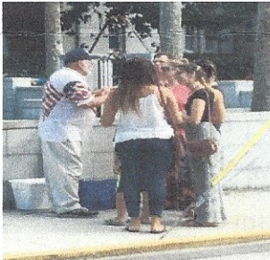
On The Streets !

February 16 th saw the start of a new evangelistic class in St. Johns County. It is a blessing to see people learn how to tell people about Jesus, because they have a true concern for the lost. They came to seek training because they wanted to "speak the Word Boldly" (Acts 14:3 NKJ) "Therefore they stayed there a long time, speaking boldly in the Lord, ... bearing witness to the word of His grace...". Praise God for these! Their efforts have seen many come to Christ !