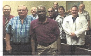
"Share Your Faith" classes in Putnam Co. at FBC San Mateo